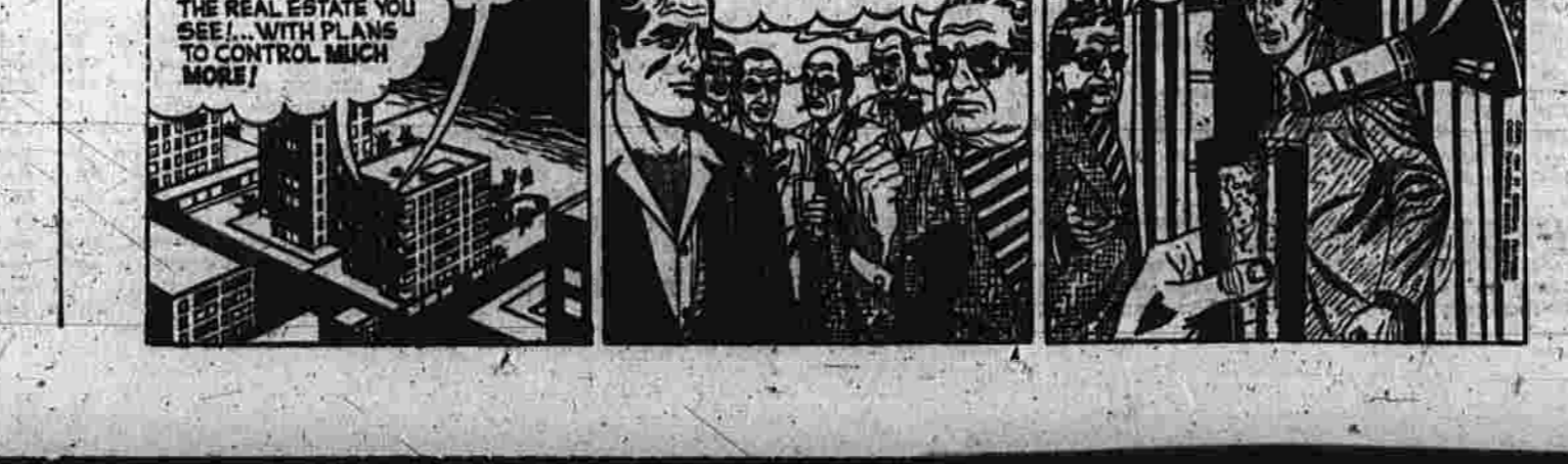
THE STORY OF MARTHA WAYNE